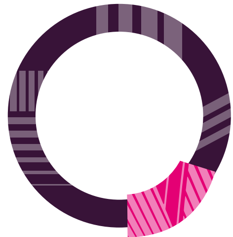
SESSION SKILLS (20 marks)

Candidates choosing this option are required to improvise in a specified style over a recorded