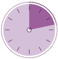
Initial 13 mins

Exams are designed to include sufficient time for setting up and presenting all components, and overall durations are as follows: