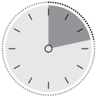
Initial 13 mins

Exams are designed to include sufficient time for setting up and presenting all sections, and overall durations are as follows: