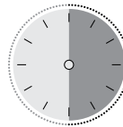
Grade 8 30 mins