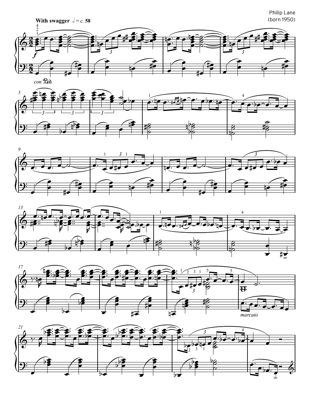
Copyright © 2014 Fulcrum Music Publications

The rhythms of this piece swagger with self-confidence, reflecting the setting of the Waldorf Hotel in 1935. A left-hand accompaniment provides a buoyant lift to the texture, while the right hand is either negotiating a range of sophisticated chord structures or indulging in the comparative simplicity of an elegant and subtly decorated solo melody line. Throughout the composition, the composer stylishly combines technical demands with a high degree of sheer musical enjoyment. A satisfying piece to perform, and with a couple of surprises awaiting the performer on the second page.