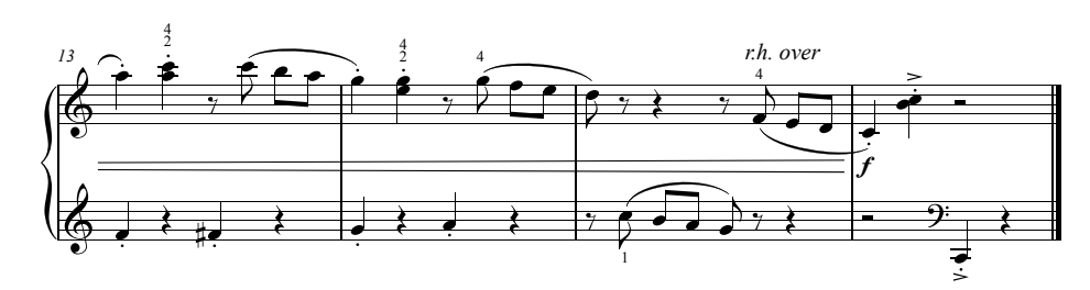
Composer's original metronome mark is \downarrow = 126